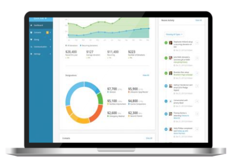
Digital workspace & online fundraising tools